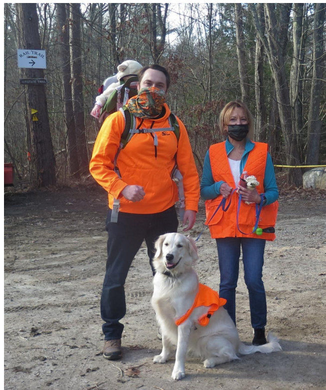
Baby's first MCRT hike

"We are blessed to have the rail trail. Thank you."